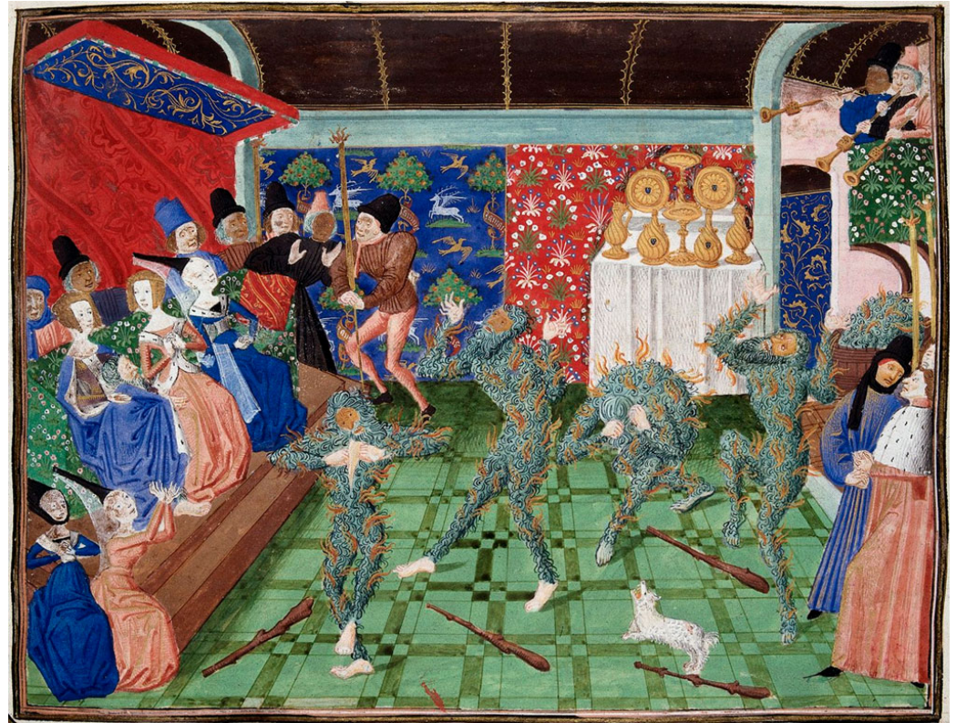
Dance of the Wodehouses. Jean Froissart, Chroniques , Vol. IV, part 2, c1470-2. British Library MS Harley 4380. f. 1.